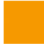
Rust FR | (TT213)