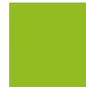
Lime FR | (TT216)