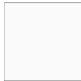
Pearl FR | (TT211)