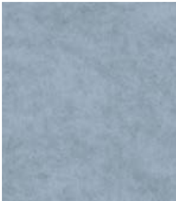
Cerulean FR | (TT231)