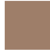
Granola FR | (TT212)