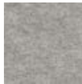
Pewter FR | (TT223)