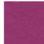
Orchid FR | (TT228)

Felted fabric finishes are only available for Architecture & Engineering market. Extended colours upon e-mail request