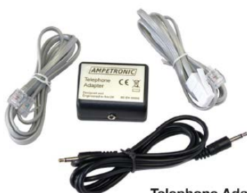
Telephone Adaptor Kit

A loop pad designed for permanent installation under a desk or counter is also available on request [Part Number GE00022].